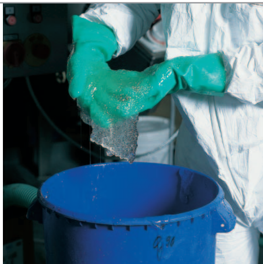
Blanose: up to over 15 % concentration