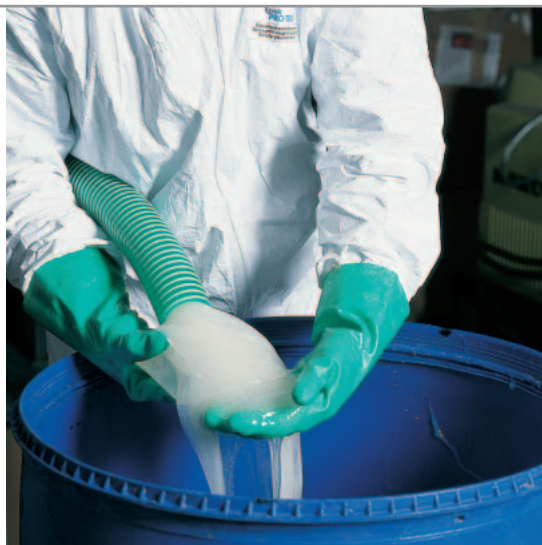
Xanthan: virtually "sausage like" extrusion