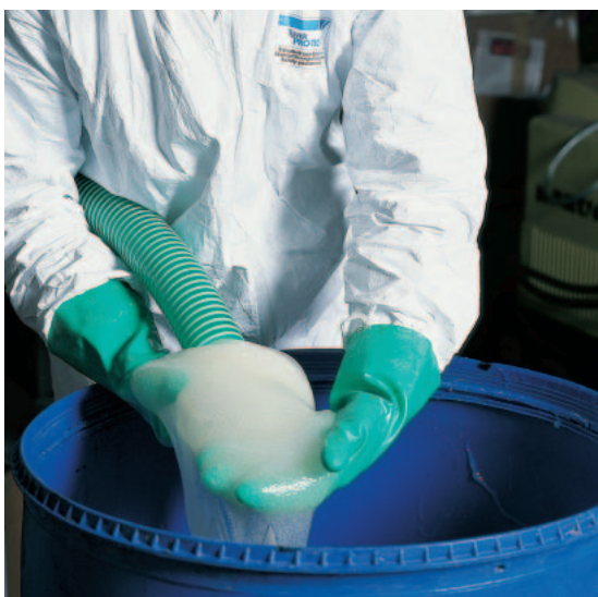
Neutragel: up to 5% concentration