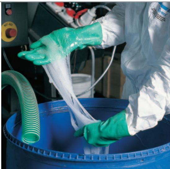
Polyox: up to 7 % concentration