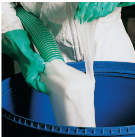
CMC: virtually "sausage like" extrusion