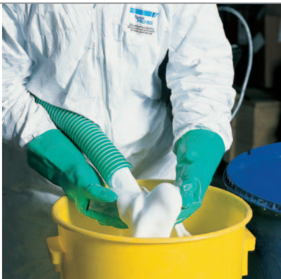
Carbopol: up to over 10 % concentration