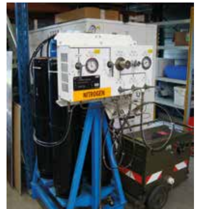
Cylinder rack storage capacity