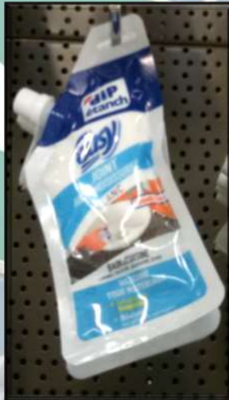
Pouch for sealant