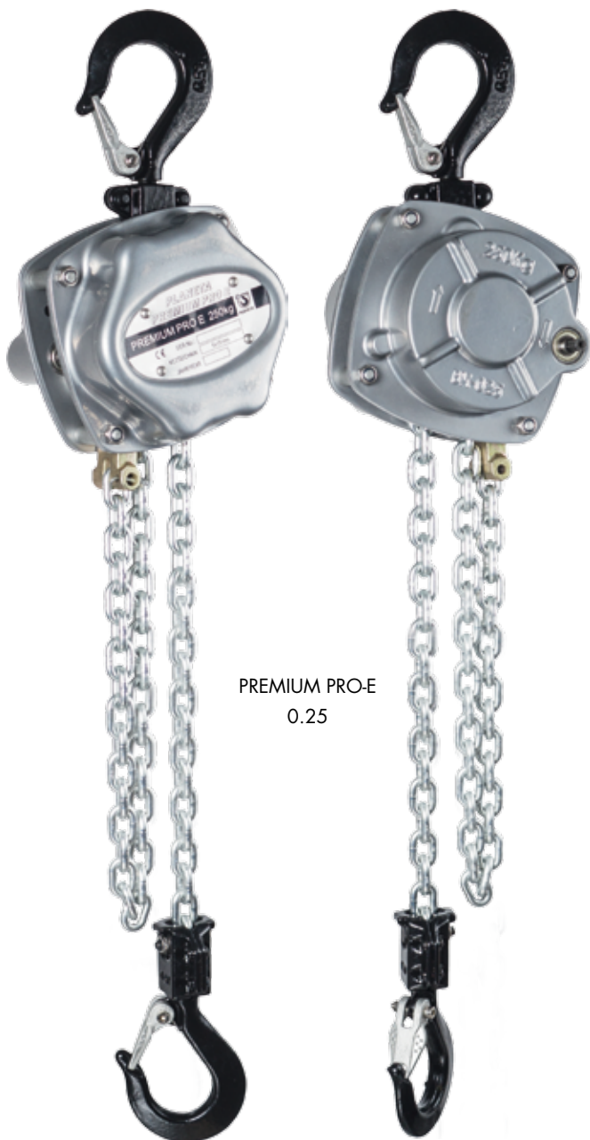
PREMIUM PRO-E 0.25