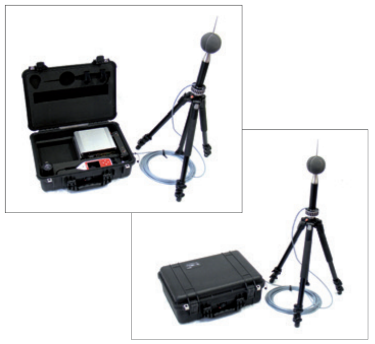
CK:670 Outdoor Kit shown with optional CT:7 Tripod

NoiseTools will display verification symbols if the information matches, a unique feature which will be useful in any legal proceedings.