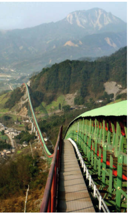
Asia Cement Group, Sichuan, China