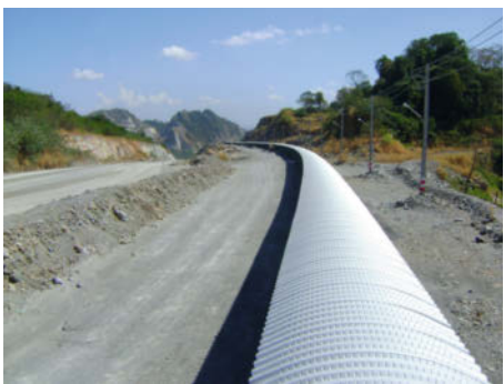
Siam Cement, Thailand