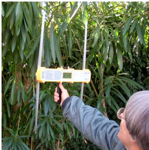
Figure 2. Operating Position for all Frequencies.

ALWAYS set the antenna blades as shown in Figure 2.