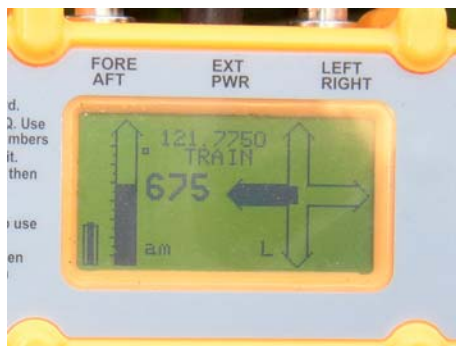
Figure 3. L-Per® Operating Screen in the DF Mode.

Figure 3 shows the operating screen in DF mode with the various condition indicators.