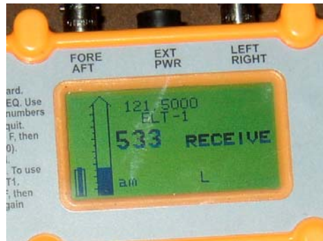
Figure 4. L-Per® Operating Screen in the Receive Mode.

should not be used for determining direction. This mode also eliminates the “buzz” present in the DF mode and makes speech easier to understand. A numerical indication supplements the vertical bar to indicate signal strength, with about 400 being the weakest signal and about 850 the strongest.