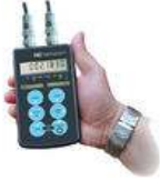
PSD232 Portable digital load cell indicator with RS232 TEDS enabled