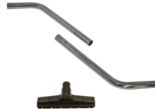
Optional 3D Accessories