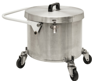
Extra recovery tank with lid to facilitate the refresh and re-use of the recovered powders (Part# 223001-ASM1) - Optional