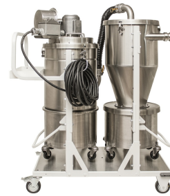
EXP1-20 DT (PRS-HEC) RE HEPA Sideview 2