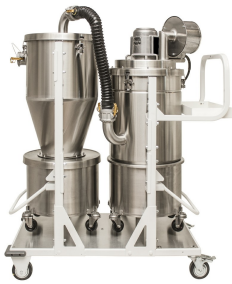
EXP1-20 DT (PRS-HEC) RE HEPA Sideview 1