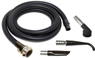
3D Tool Kit for 2" camlock suction inlet - included