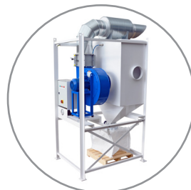
MOBILE DUST EXTRACTION UNITS