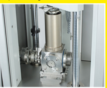
Volumetric dosing of HDP – high accuracy of filling quantity