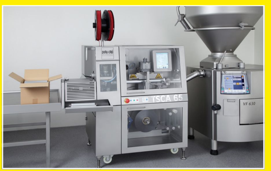
Efficient packaging of e.g. adhesives, sealants and explosives using the TSCA 65 D