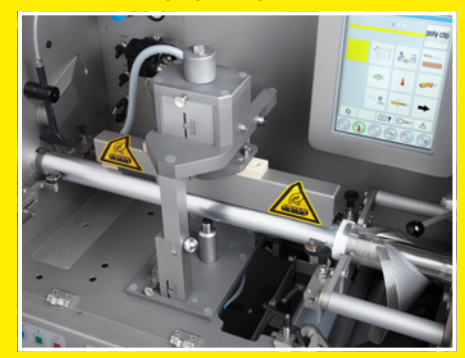
The TSCA 65 D heat-sealing station