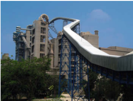
Indocement Tunggal Prakarsa, Indonesia