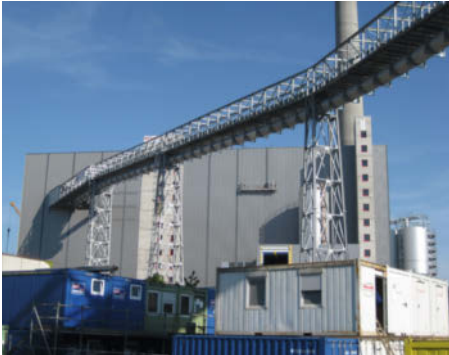
Linz AG, Austria