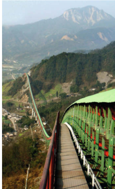
Asia Cement Group, Sichuan, China