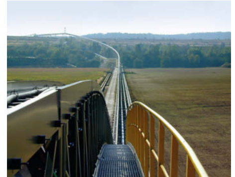
Mělník, Czech Republic