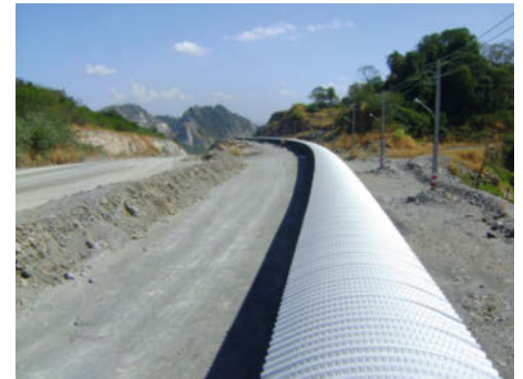
Siam Cement, Thailand