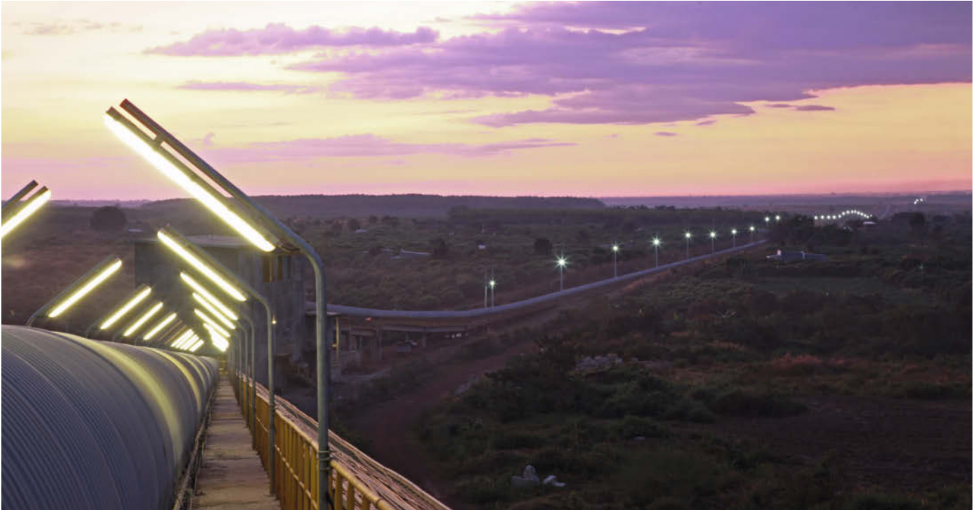
The BEUMER open troughed belt conveyors ensure high mass flows for all products.

Rough, mountainous and fragmented terrain with extreme differences in height is nothing the BEUMER belt conveyors can't handle. The routing of the belt conveyors is adapted to the geographic and topographic conditions by combining horizontal and vertical curves.