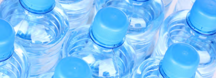
MEDICINE & PHARMACEUTICALS