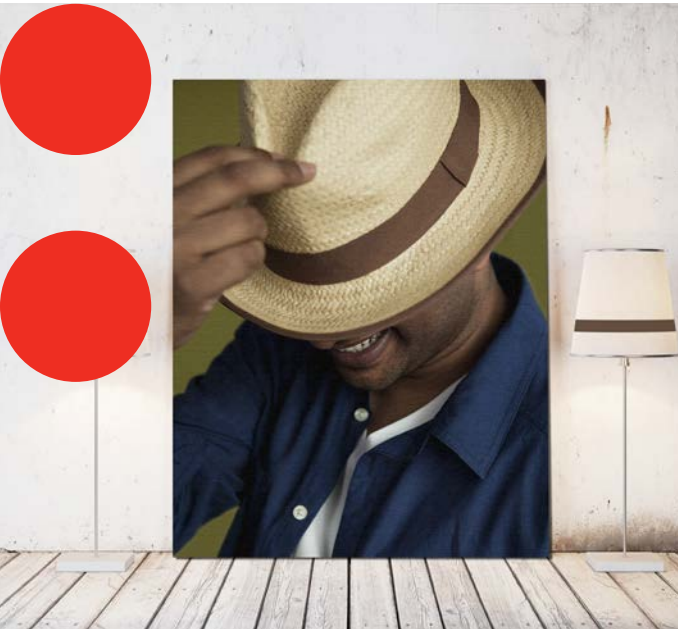
In-house decoration - dibond

The Anapurna M2050i hybrid printer meets the performance and quality demands of an increasingly professional market – at a highly competitive price point.