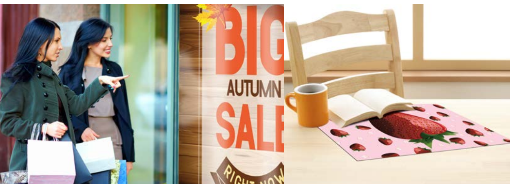
In-store communication - paper

White ink creates new possibilities for printing on transparent material for backlit or backlit/frontlit applications or printing white as a spot color. You might even consider printing images on dark substrates using white ink only. Stand out and let Anapurna M2050i differentiate your decoration and communication jobs.