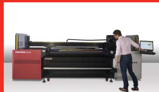
Anapurna M2050i prints rigids or rolls at top class productivity.