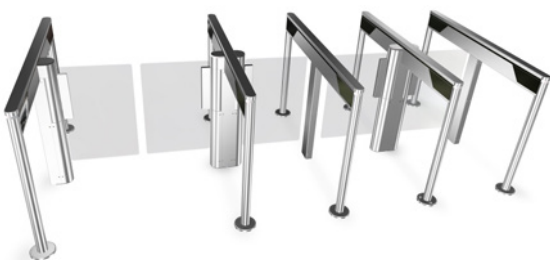
SL 950 + SL 944 + SL 945 Twin

The SlimLane 944 is a modular product that can be installed as a single or a multi-lane array by combining with the SlimLane 945 Twin dual compact lane, the SlimLane 940 standard lane and SlimLane 950 wide lane models.