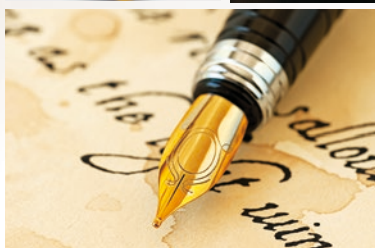
Fine jewelry and watches, gold bars and accessories – diverse fields of application for Fischer measuring technology