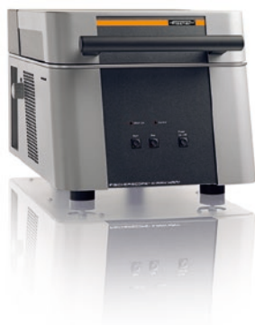
FISCHERSCOPE® X-RAY XAN® 220/250