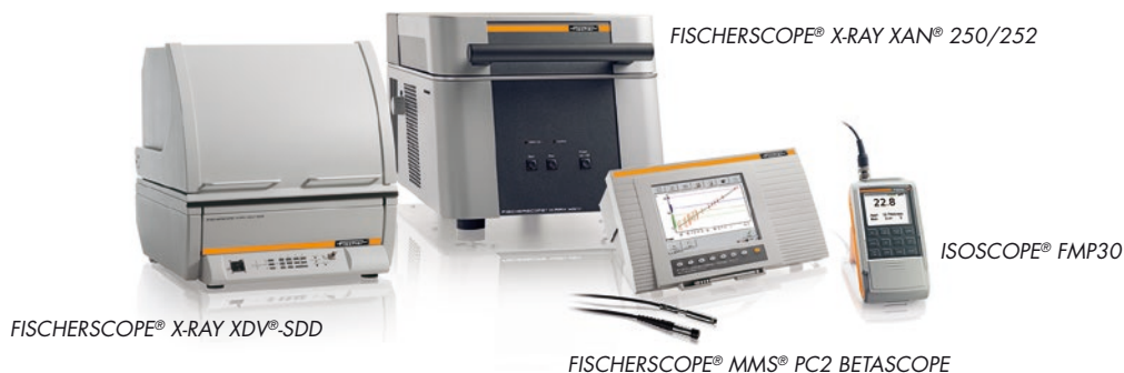
FISCHERSCOPE® X-RAY XDV®-SDD

Precise thickness measurement of lacquer coatings on metallic watch dials is easy with the portable instruments of the FMP series and the FTA3.3-5.6 probe.