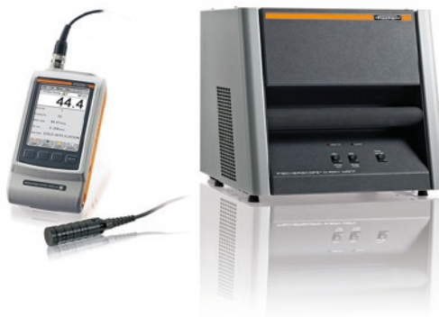
FISCHERSCOPE® X-RAY XAN® 315

The FISCHERSCOPE X-RAY XAN 315 is ideally suited for use in the buying and selling of gold and precious metals.