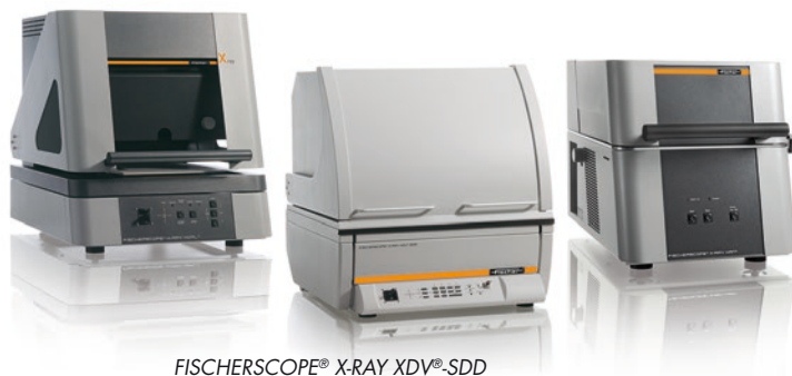
FISCHERSCOPE® X-RAY XDV®-SDD